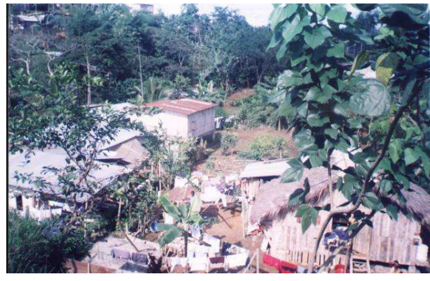
Community of Puerto Quito. The project will be implemented in rural areas as well as in the periphery of the Municipal capitals.

The Ministry of Health also will include the Municipal Health Services in their promotion activities, as well as the schools, local governments, NGOs, grass-root organizations and opinion leaders. According to the laws of Ecuador, the Ministry of Health is responsible for supervising the quality of the drinking water in the rural area – therefore, the task of promoting household water treatment is very adequate for this institution.